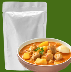
DISHES CURRY CHICKEN/ HERBAL CHICKEN