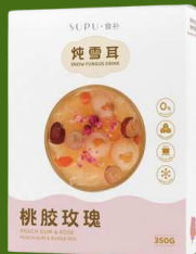
DESSERT SNOW FUNGUS/ RED OR GREEN BEAN