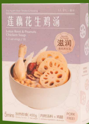
SOUP HERBAL/ CHICKEN SOUP