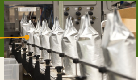
FILLING SEALING MACHINE