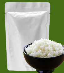
SIDES RICE/ PORRIDGE/ SWEET POTATO