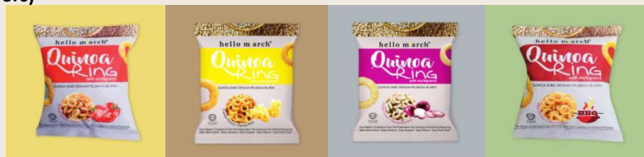
Quinoa Ring snacks (assorted flavors)

" We bring you the life giving nourishment of springtime to fill your life with hopes and possibilities. " ~ Hello M'arch ~