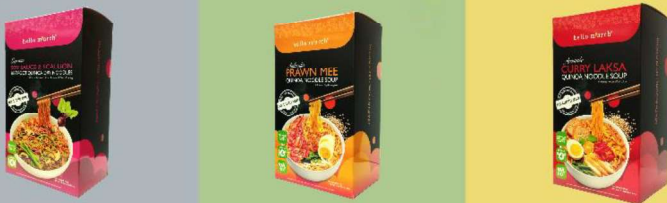
Instant Quinoa Noodles Meal Kit (assorted flavors)