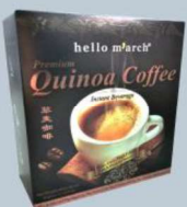
Quinoa Arabica Coffee