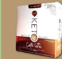
KETO Arabica Caffè Latte

MORNING ARCH SDN. BHD. (MALAYSIA) Block J-05-05, No. 2 Jalan Solaris, Solaris Mont Kiara, 50480 Kuala Lumpur, Malaysia. Office • (603) 6206 2571 or Mobile • (6012) 208 7662 Email • info@hello-march.com www.hello-march.com