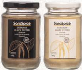
SaraSpice Black/ White Pepper Ground (Jar) 160g