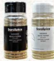
SaraSpice Black/ White Pepper Ground (Shaker) 60g

A wholly-owned subsidiary of the Malaysian Pepper Board, which was established in 2019 to promote and market Sarawak pepper worldwide. Envisioned to source for the best quality pepper and markets it to global customers as well as to promote and create awareness on sustainable Sarawak pepper.