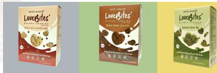
Gluten-Free Quinoa Cookies (assorted flavors)