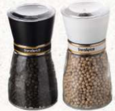
SaraSpice Black/ White Pepper Berries (Grinder) 100g