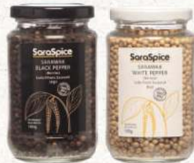
SaraSpice Black/ White Pepper Berries (Jar) 190g