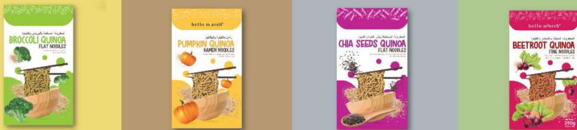
Healthy Quinoa Noodles (assorted flavors)