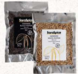
SaraSpice Black/ White Pepper Berries (Soft Pack) *