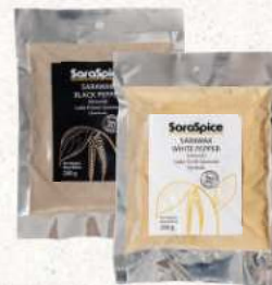
SaraSpice Black/ White Pepper Ground (Soft Pack) *