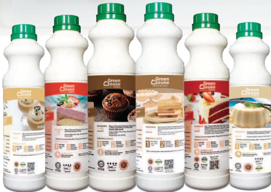
Earl Grey Emulco