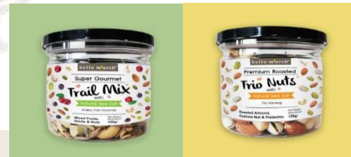
Super Gourmet Trail Mix