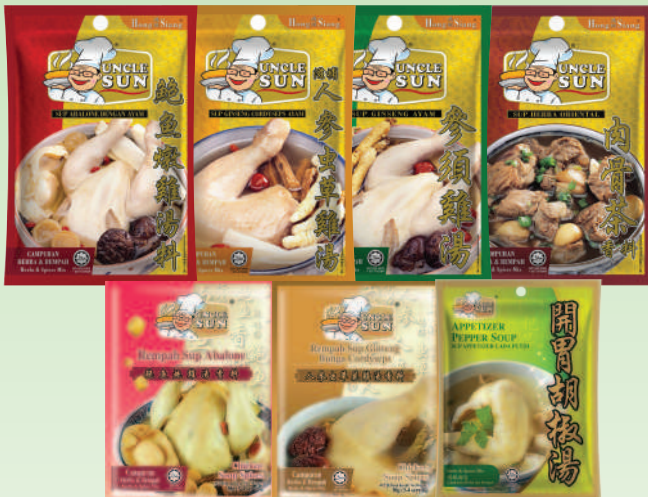
Herbs & Spices