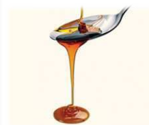
Caramelised Sugar Syrup